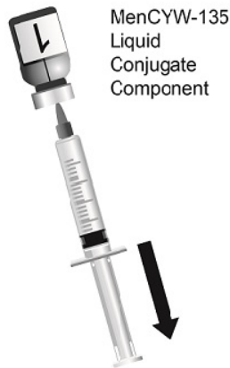
Figure 1. Cleanse both vial stoppers. Using a sterile needle and sterile graduated syringe, withdraw the entire contents of Vial 1 containing the MenCYW-135 liquid conjugate component while slightly tilting the vial.