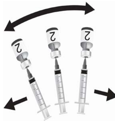
Figure 3. Invert the vial and shake well until powder is completely dissolved.